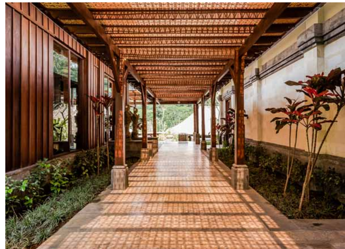
A RIVER RUNS THROUGH IT CLOCKWISE FROM THIS PAGE, LEFT

Simple bamboo woven pattern — found in most Indonesian village — were used to layer the walking canopy, casts a live pattern that enriches the equally simple floor panels