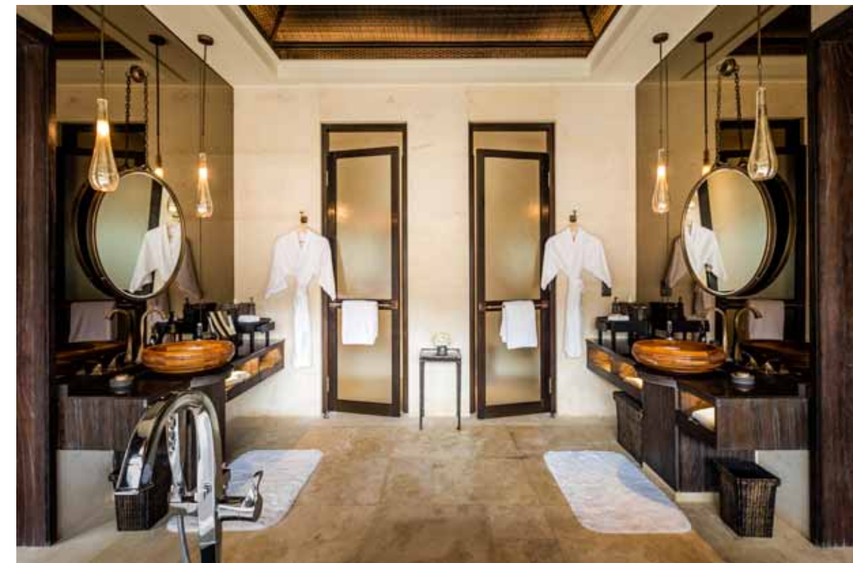
A RIVER RUNS THROUGH IT CLOCKWISE FROM OPPOSITE PAGE, TOP

The bathroom in the Villa uses a bronze-finished fixture. All of the wash basins are specially designed in wood